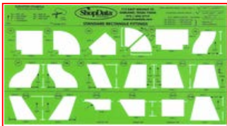
Rectangular Drawing Template

*Credit Card Billing Address: _____ *City: _____ *State: _____ *Zip: _____